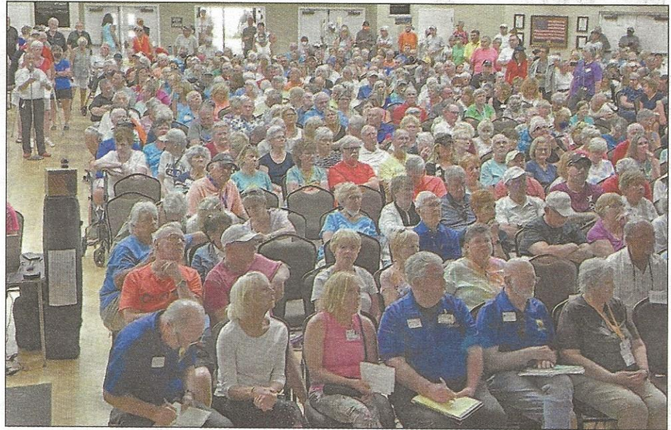
Over 900 Community Association members attended the meeting. Some were in the main room. Some in adjoining spaces off to the side.

ClubLink is tentatively planning to hold another meeting with residents